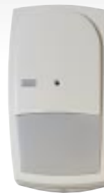
Pinhole lens camera

A low cost, small discreet camera designed to blend into any small business or residential environment.