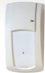
EV 500 Case with PH lens camera and working PIR

* with Pinhole lens Dimensions (mm): 50(W) x 92(H) x 33(D) IR option available