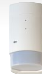
DD 400 Case with camera and working PIR

A low light camera mounted inside an operational PIR detector for discreet surveillance in any domestic or commercial environment.