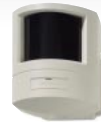
Standard lens camera

Dimensions (mm): 50(W) x 92(H) x 33(D) IR option available